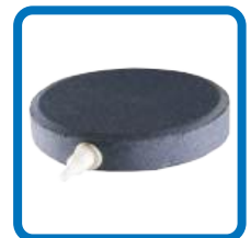
GREY ROUND AIRSTONE