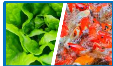
HYDROPONICS / AQUATICS